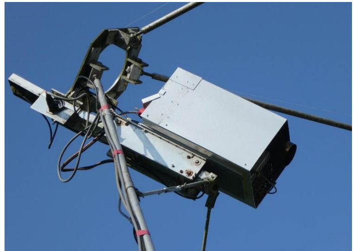
G4NNS' 6 cm feed box in place at feed point

The ARRL MW EME Contest provided a good opportunity to test the rebuilds. I worked using CW on 12 Sept, on 9 cm SP6OPN, SP2XBO for initial #31, DF3RU #32 and SM3BYA #33; and on 13 Sept on 6 cm RA3EME, G3LTF, OK1CA, SM6FHZ, G3CCH, SM6CKU and K2UYH for a score of 4x3 on 9 cm and 7x4 on 6 cm and a total of 11x7. For the ARI Contest on 20 Oct the sub reflector was fitted along with the 3 cm transverter to work using CW UA4AAV for initial #66, OZ1LPR, LX1DB, DL4DTU, OK1CA, OK2AQ, OK1DFC and S57RA #67 were worked for a total of 8 QSOs. Various stations that should have been easily workable on CW were heard using digital modes only.