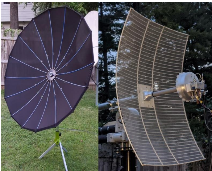
W2HRO folding cloth 1.8 m dish (L) great for portable EME and 0.8 m dish with patch feed (R)

W5ZN: Joel w5zn@w5zn.org (EM45dh) is QRZ from Arkansas on 220, but is working on 1296 EME -- My plan is to completed the mounting of a 15' (4.6 m) Scientific Atlanta dish that I have had for several years. I hope to have that fully functional sometime in Oct, but the date is dependent on obtaining a couple of things such as pinion gears.