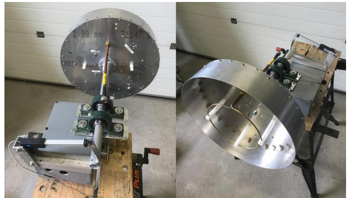
PA3DZL's 432 ring feed and pol rotator

DL7APV (of course!). The first 2 weeks I used my old LZ2US GS23b tube PA at about 600 W @ feed due to low drive power. On 16 Sept, I finished an SSPA, and am now running 1 kW @ feed. I am surprised that I can work small 1 yagi stations running "low" power. I was also very happy to do some CW QSOs not just with big guns but smaller stations too. In Sept I worked using JT65B unless noted DL7APV (10DB), SM5EPO, VK4EME, EA5CJ, PA2V (16DB), SV8CS for mixed initial #231*, DK3WG, SQ9CYD #232*, HB9Q (5DB), GW3TKH #233*, GM6VXB #234*, OK1TEH, SV8CS, DL6SH #235* (559) using CW and JT65B, EA5CJ, DL8DAU (21DB), IW4ARD #236*, OH6UW, GW4LWD #237*, SM7THS (14DB), UT5DL, DK5SO #238*, DL9KR (579) using CW, G3LGR #239*, ZS4TX #240*, K5QE, UX0FF, YO2NAA #241*, LU1CGB #242* and DXCC 66. So far, I have made 58 QSOs, 53 with JT65B and 5 using CW, added 25 initials and 3 new DXCCs.