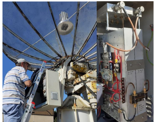
F5KUG's 3 m dish with their new scaler ring and SSPA in box on left, and SSPA with couplers shown on right

700 W and we added a choke made from a pancake as described by KL6M to our septum feed. Despite these efforts, we QSO'd only 15 stations (all from EU) in 5 hours of trying. We hope to do better in the ARRL Contest! Our new PA is the result of combining two Freescale/NPX demo/test modules. The LDMOS devices in these modules are in plastic packages and operate from a 50 V drain supply. Each is able to provide 350/400 W. We use a 20/30 W driver with an MRF9045. It drives the LDMOS modules thru a 3 dB wireline coupler. The modules' outputs are coupled by a high power DJ9BV coupler. This may not be the most up to date technology but was by far the easiest way for us to achieve 700 W of power. We are waiting for the LDMOS to reach 100 V - HI. [That may be a while]. The success of our new SSPA is the result of F5BUU efforts who deserves credit for the mechanical and high frequency constructions. [TNX to G3LTF for forwarding this report].