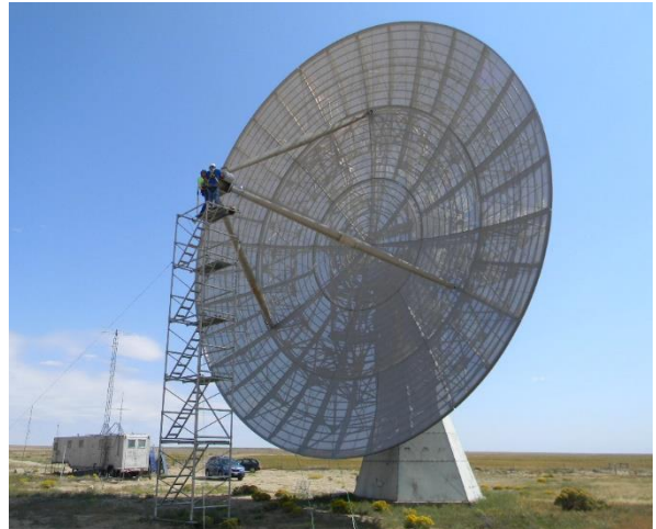
KOPRT 60' dish to be QRV on 1296 during Oct ARRL Contest weekend - see their report

DB6NT: Michael db6nt@gmx.de had a big signal in the ARRL MW Contest – I worked using CW on 13 cm DF3RU, RA3EME, G3LTF, UA3PTW, OM1TF, SP7DCS, SP3XBO, SA6BUN, G4CCH, WA9FWD and G3LTF (on SSB) for a total of 10x7 ; on 6 cm OK1CA, G3LTF, SP6JLW, SM6FHZ,