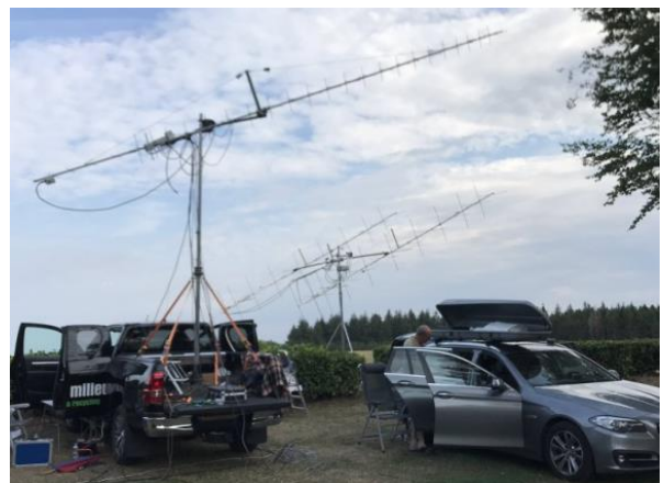
LX/PA3CMC dxpedition – 432 is upper on left

LX/PA3CMC: Chris (PA2CHR) post@pa2chr.nl reports that during the ARI Contest on 19/20 Sept he, PA3FYC and Lins PA3CMC were QRV on 70 cm (and 2 m) EME from Luxemburg in JN29VW – we used both the calls LX/PA3FYC and LX/PA3CMC. On 70 cm used a single 27 el yagi horz and a 23 el yagi vert for X-pol with 400 W. Although the condx were bad, we worked several stations such as OK1KIR and DL7APV