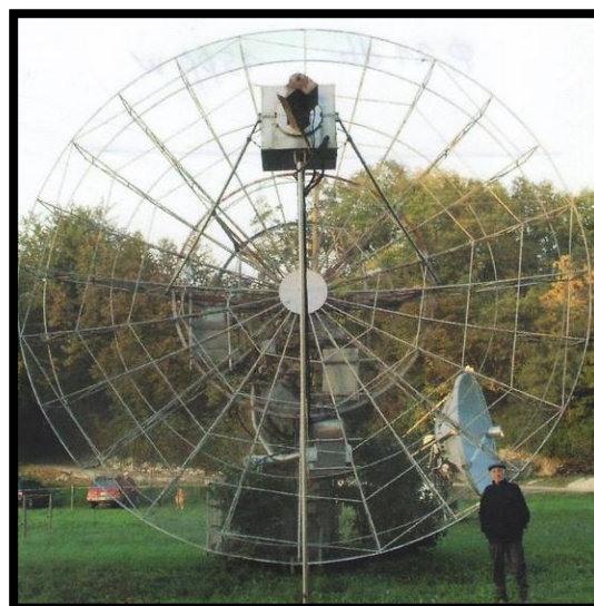
HB9Q with his dishes – RIP dear friend

The final Contest weekend is 25 and 26 Nov. I am anticipating a lot of activity as the Moon times are