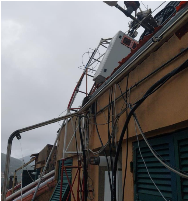
IK1FJI's dish disaster

IK1FJI: Valter valter_dls@yahoo.it sends disappointing news that he is QRT [temporarily] on 23 cm – Unfortunately my tower was bent over by 110 km/h (68.5 mph) winds. Thus, I must replace it, but the work will not be easy on top of my roof! I will be watching the situation concerning the future of 1296 here in the EU. If need be, I will use the rebuilt dish for some other bands.