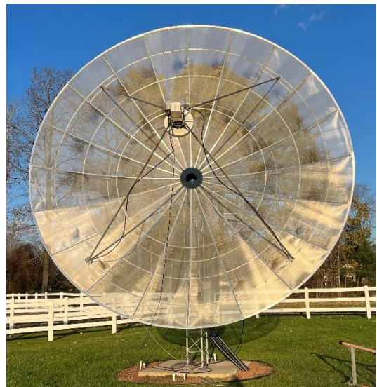
NC1I's new 6.1 m dish for 1296