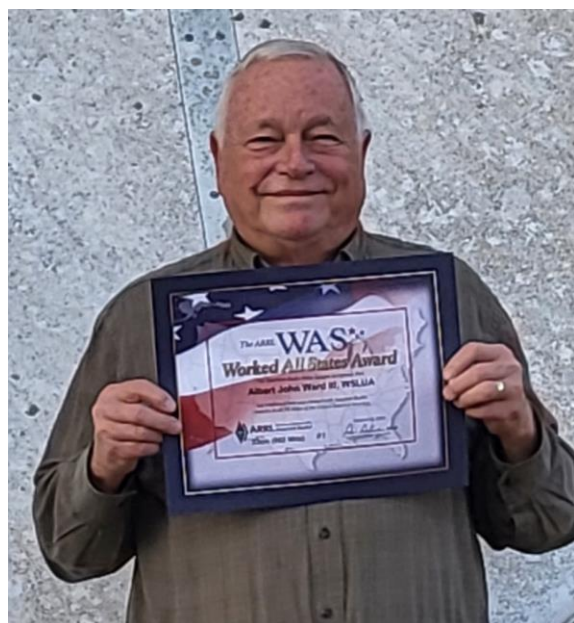
W5LUA with 1st 902 WAS Certificate